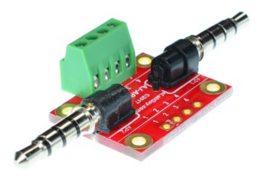
Figure 4: AP-AP-V1A with terminal block