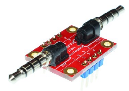
Figure 3: AP-AP-V1A with headers